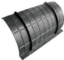
Fence - 39.37" (1 m)