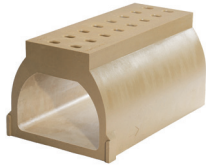
KT500 Tunnel - 39.37" (1 m)