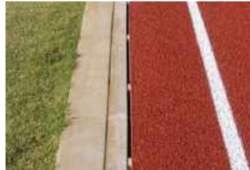
Polymer Concrete Surface Exposed edges will not rust or discolor surrounding surfaces