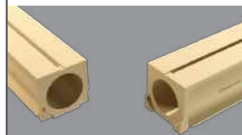
Interconnecting Profiles Channels fit together easily and securely via linking end profiles