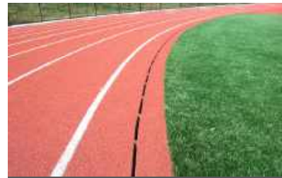
Drainage Slot 0.5" ADA compliant drainage slot offset from the center of the channel