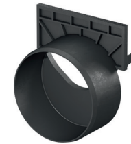
Outlet end cap