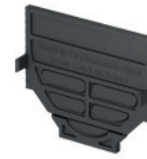
Closing end cap