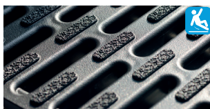
Microgrip anti-slip texturing on plastic grates