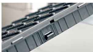
Locking push-fit grate