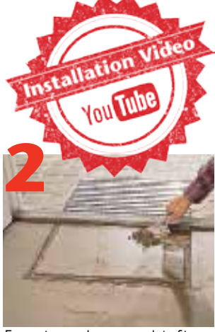
Excavate area large enough to fit DrainMat base.