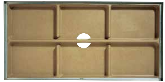
Polymer concrete base with 4" schedule 40 outlet - large