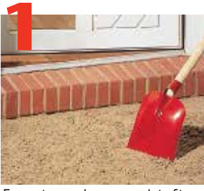
Excavate area large enough to fit DrainMat base, add 2" sand and compact well.