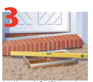
Level base unit. Backfill surround with concrete and finish surface as desired (tile, paver, etc.).