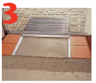
Install MatFrame, tile floor ensuring surface is 1/8" higher than MatFrame to prevent trip hazard.