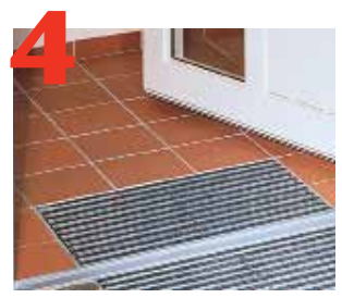
Install mat and installation is complete.