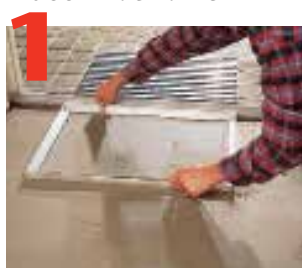
Measure area where MatFrame will be placed indoors.