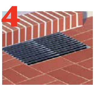
Ensure finished surface is 1/8" higher than the DrainMat to assist water drainage. Fit mat into finished installation.