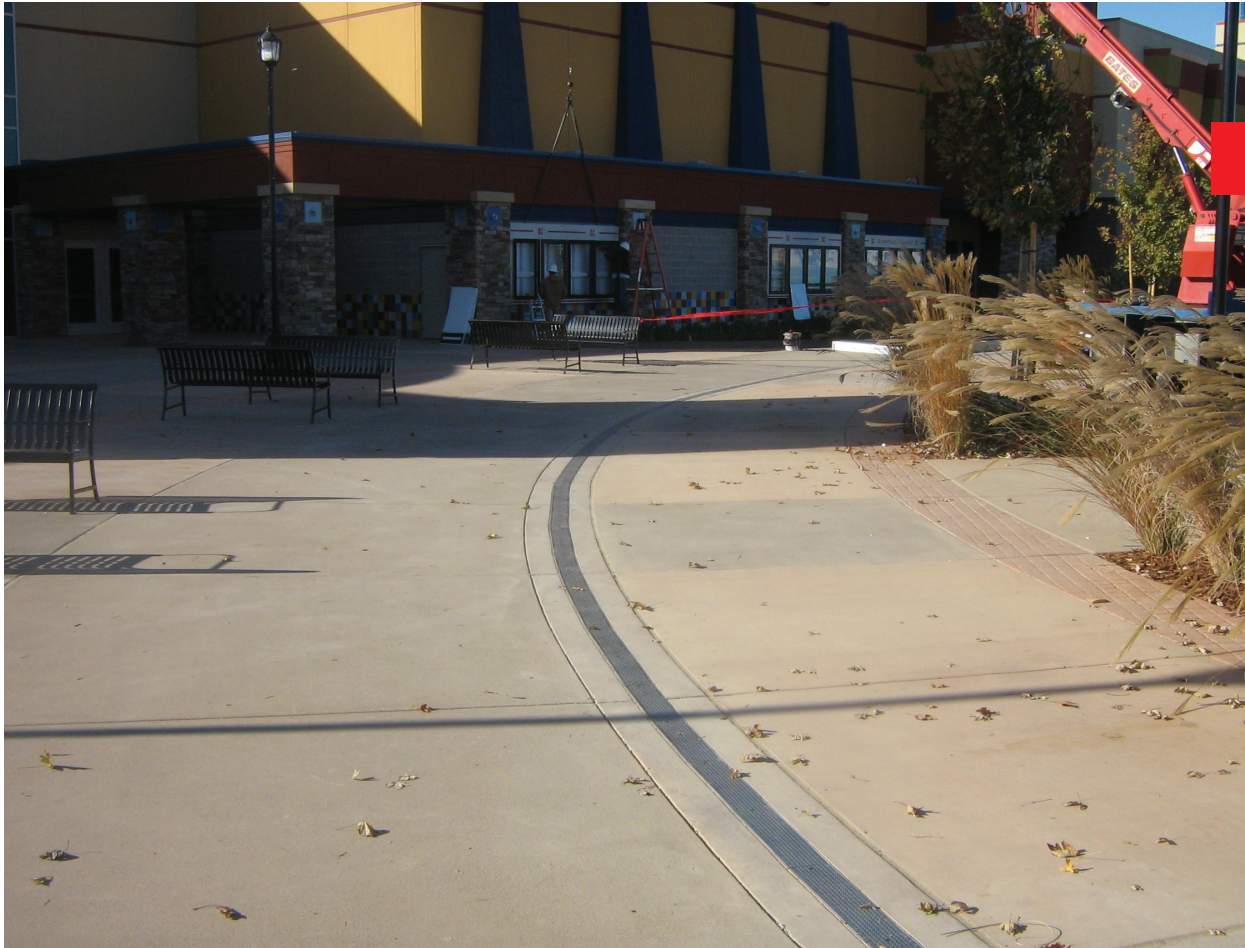
ACO Drain KlassikDrain K100 with Galvanized Perforated www.acodrain.us